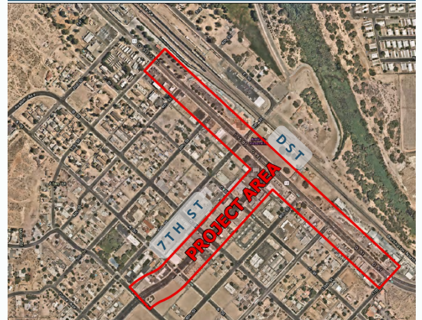
OLD TOWN FACADE IMPROVEMENT PROJECT

Visit VictorvilleCA.gov/OTFacadeProgram for more information. Applications will be reviewed in the order they are received.